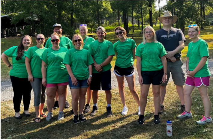
Moravia Central School District faculty & staff at Camp Gregory in Aurora for United Way of Cayuga County's 4th Annual Day of Caring (8/1/2024)