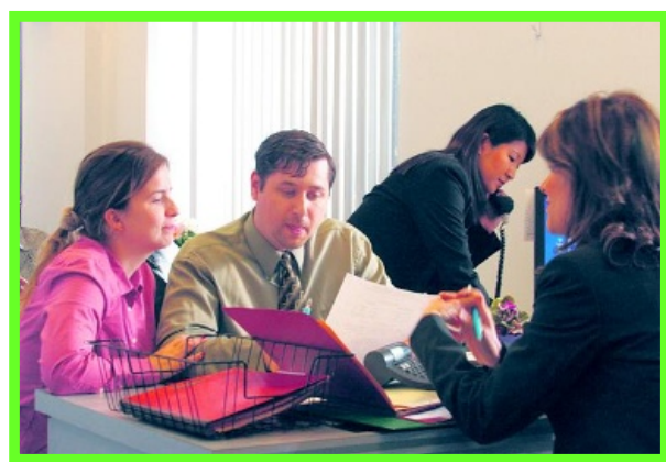
Couple seeking assistance