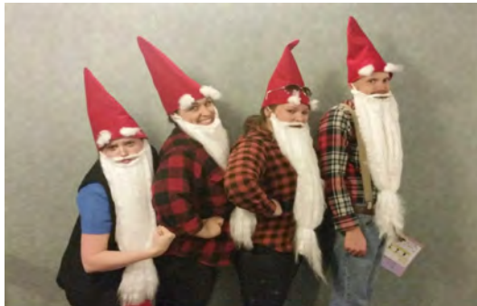
Best Team Costume Winners "Gnome More Mr. Mr. Nice Guy"